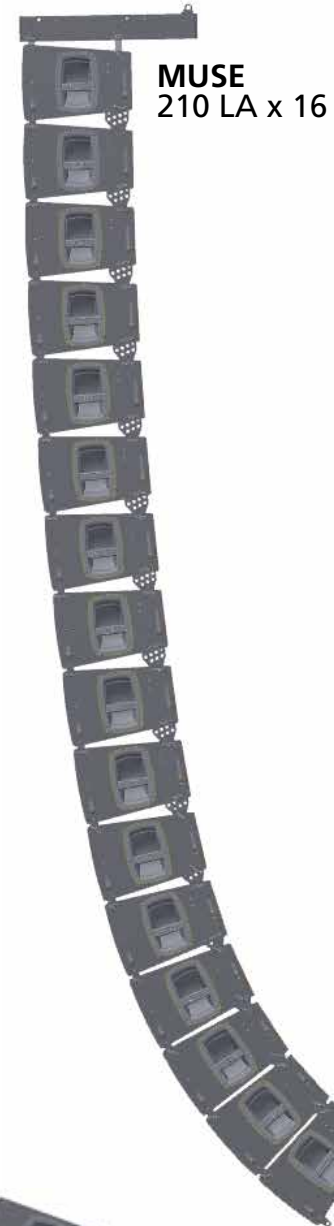
MUSE 210 LA x 16