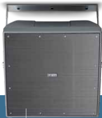
Shadow 112 CT 600W