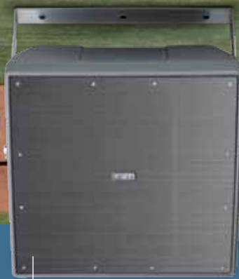
Shadow 112 HC 600W