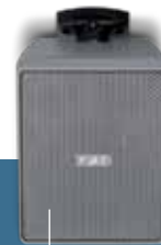
Shadow 105 T 120W