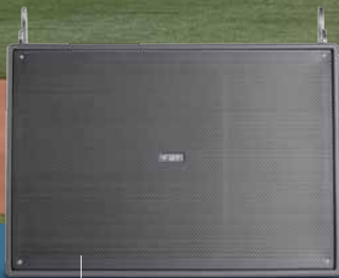
Shadow 142 L 1000W