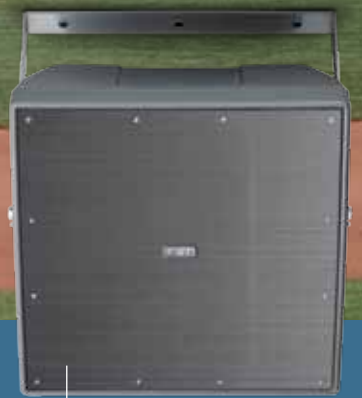
Shadow 114 S 700W