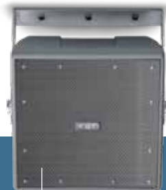
Shadow 108 CT 450W