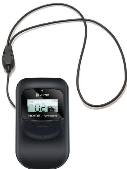
TeamTalk-P with NL-90 Neckloop