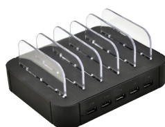
USB 5 port Charging station