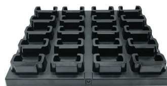
CS-20X 20-slot charger station

For complete manual, please refer to univox.eu .