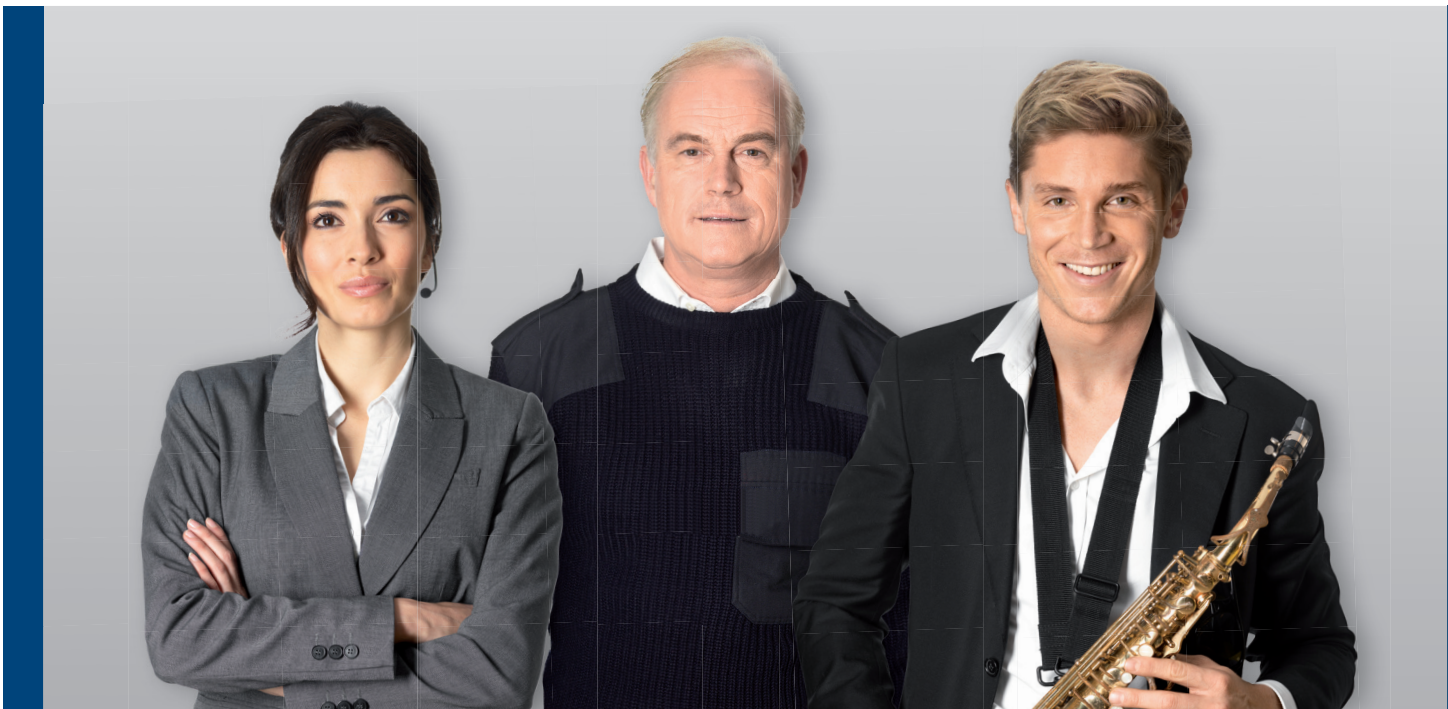
PAVIRO: Public Address, Voice Evacuation, Professional Sound Quality

24 Zone Router with 4 channels Max 20 routers per controller supporting up to 492 loudspeaker zones.