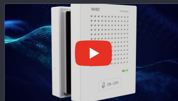
Video: The VoiceBridge 2.0

Note that the unit has a sensor on the customer side, set to approx 80cm, that automatically switches the unit on when someone approaches.